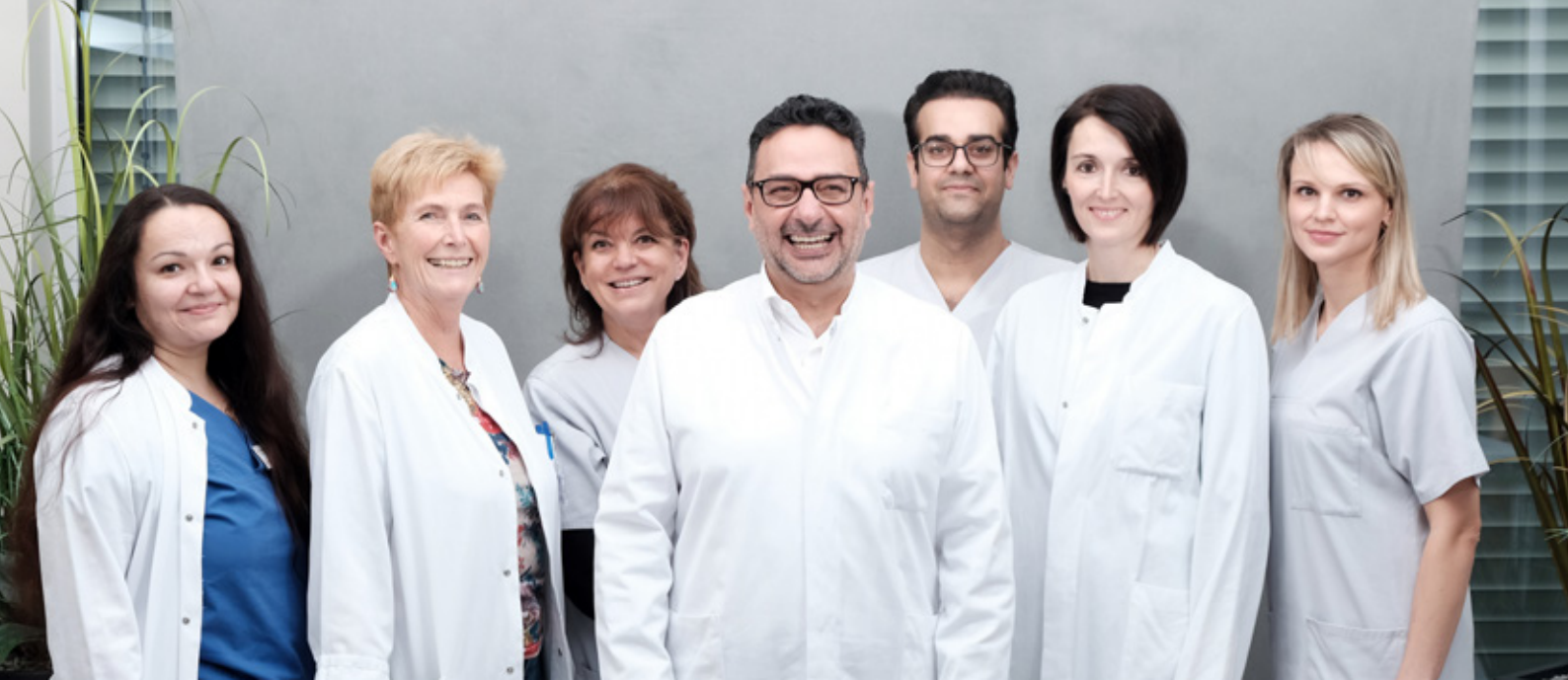
The Department of Gynecology and Obstetrics' physician team